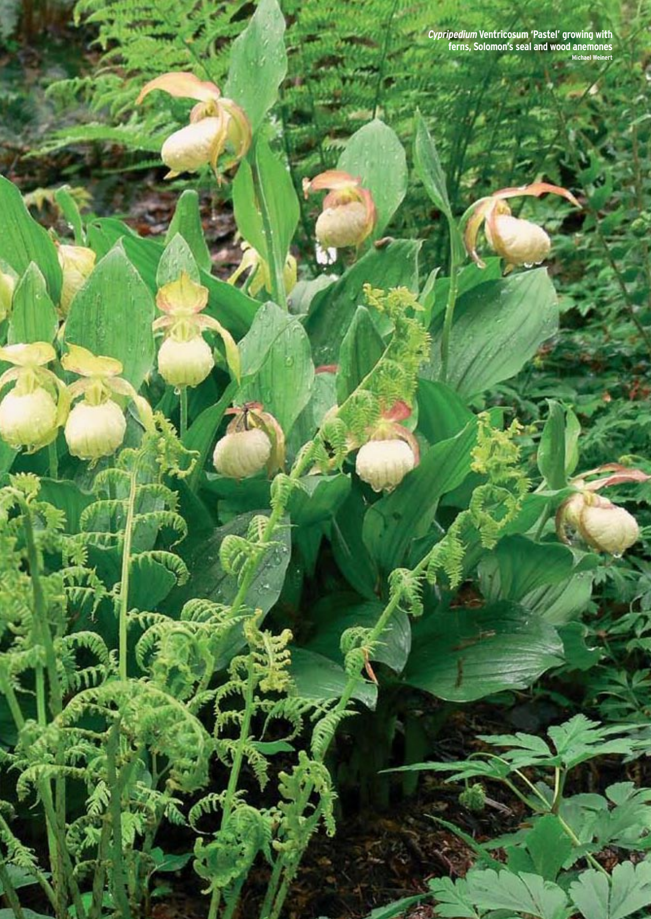
Cypripedium Ventricosum 'Pastel' growing with ferns, Solomon's seal and wood anemones