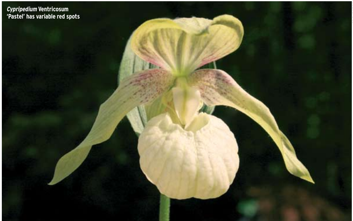
Cypripedium Ventricosum 'Pastel' has variable red spots

The broad leaves and strong stem make it a very stable garden plant that can even withstand strong rain or