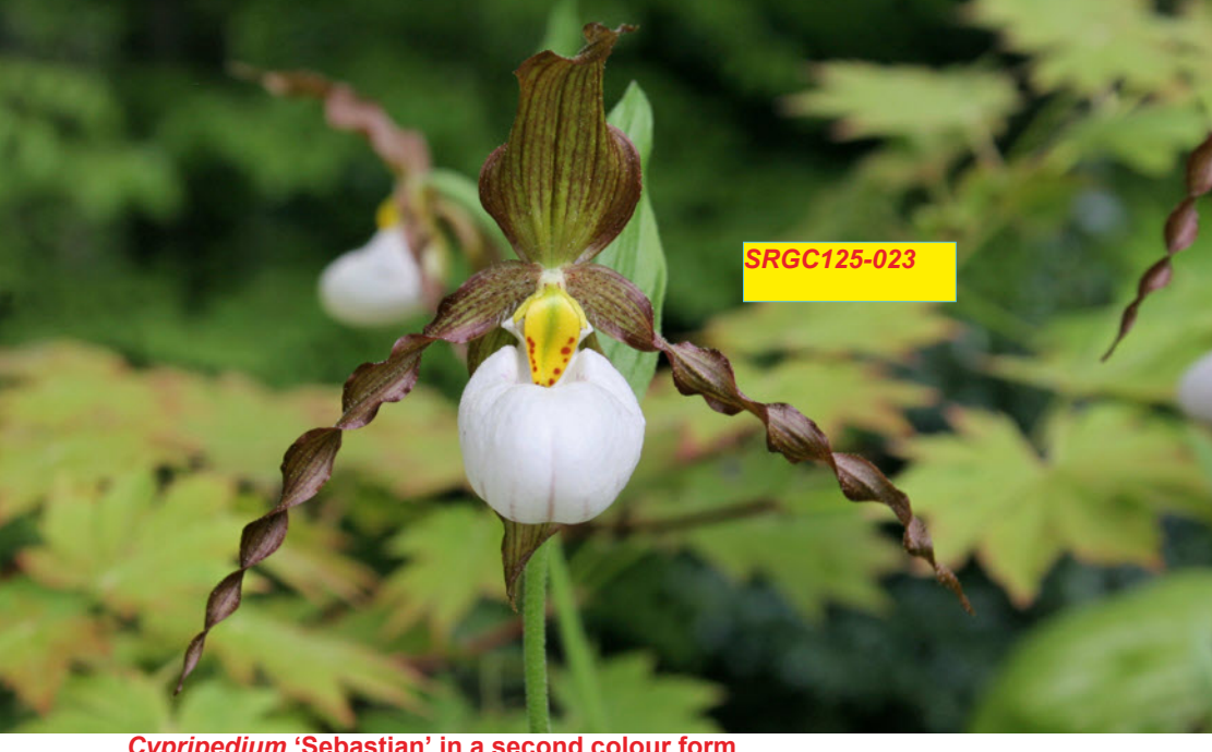
Cypripedium 'Sebastian' in a second colour form

Thirdly, the soil is not important; any average garden soil suffices as long as it is not permanently dry or wet. Last but not least, fertilize your Cypripedium 'Sebastian' during springtime with any normal garden fertilizer in half concentration. That's all there is to it: then relax and enjoy this beauty of the shaded garden!