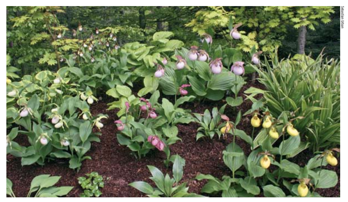
Cypripedium hybrids flourising under Japanese maples, from left, C. Ventricosum 'Pastel', C. Sebastian, C. Ventricosum, C. Sabine and C. Sunny

wind. It grows 40–55cm tall and forms impressive clumps within a few years. I recommend it highly.